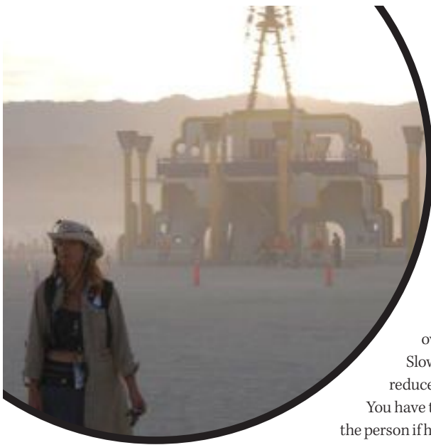
The last standing of the Man, 2006.