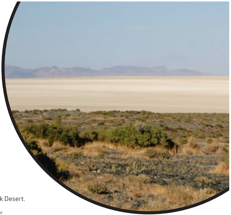
The Black Rock Desert.