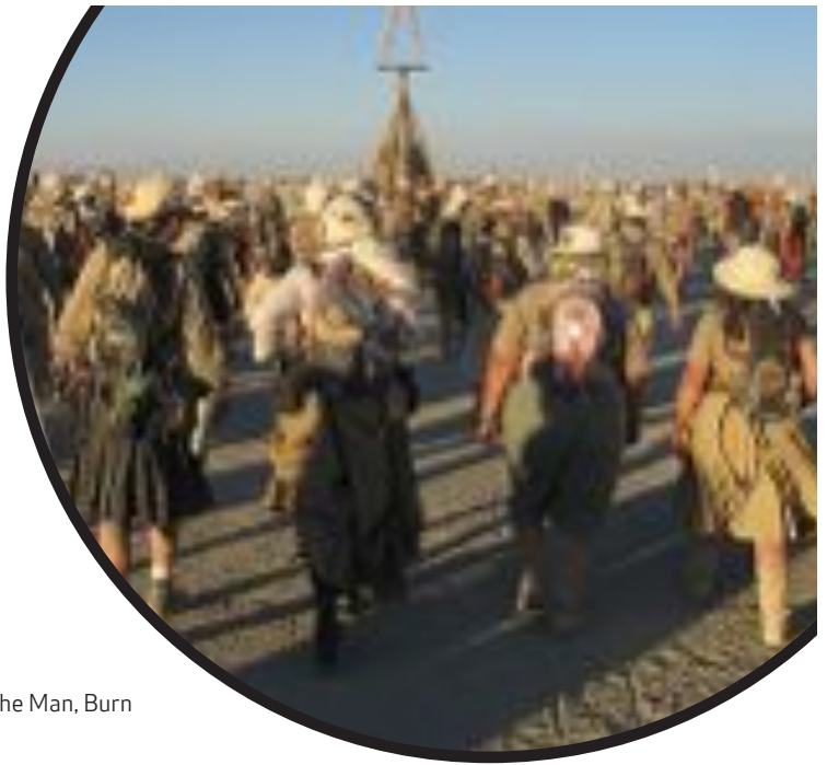
Rangers walk to the Man, Burn Night 2007.